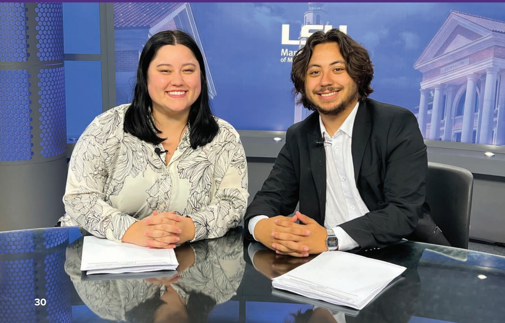
(Below) Tiger TV anchors in the studio.