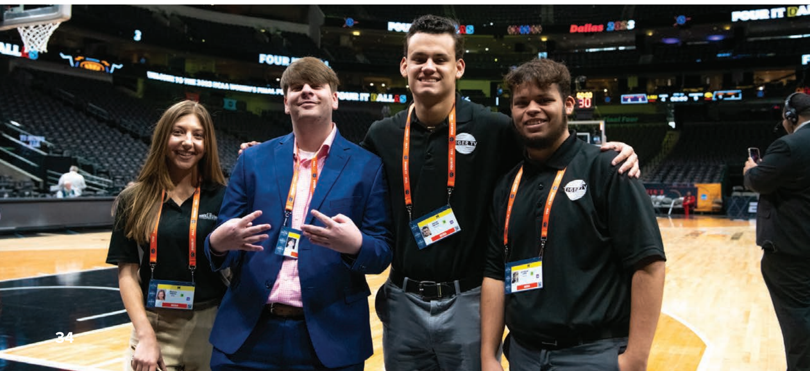
(Below) KLSU and Tiger TV students work the 2023 NCAA Women's Final Four.