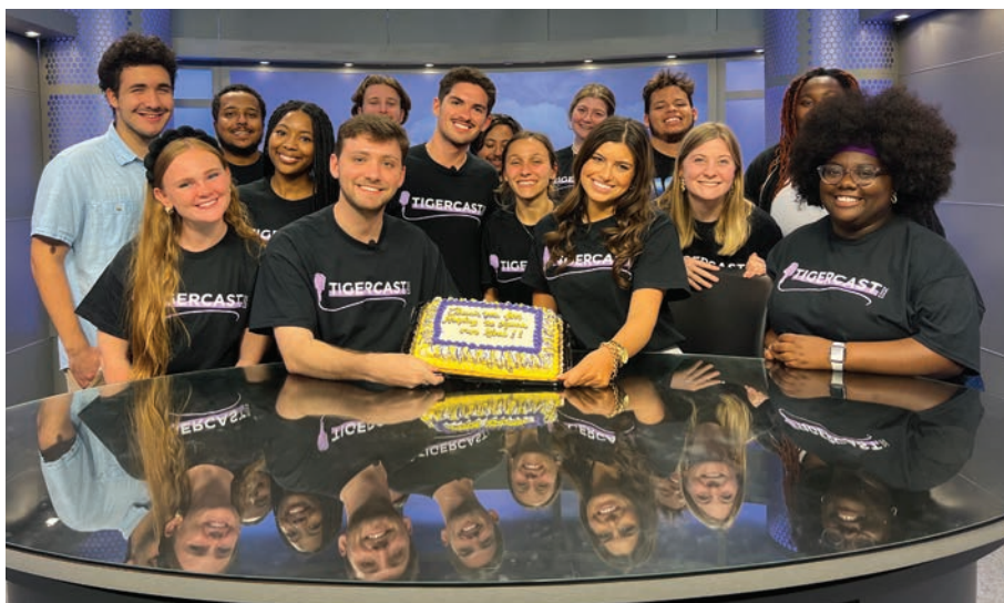
Tigercast students in the Tiger TV Studio following their 24-hour fundraiser.

A collaboration between Tiger TV, Student Government and Student Philanthropy Council, Tigercast is a 24-hour student-run fundraiser with the goal to raise money for LSU's Student Emergency Support Fund. Manship School students represented Tigercast's leadership team. In spring 2023, students raised $4,420 to directly support students affected by stressful situations like fires, floods and medical emergencies. LSU Campus Life awarded Tigercast three Love Purple, Live Gold Awards in 2023: Outstanding Service Program, Outstanding Advocacy Program and Outstanding Collaborative Program.