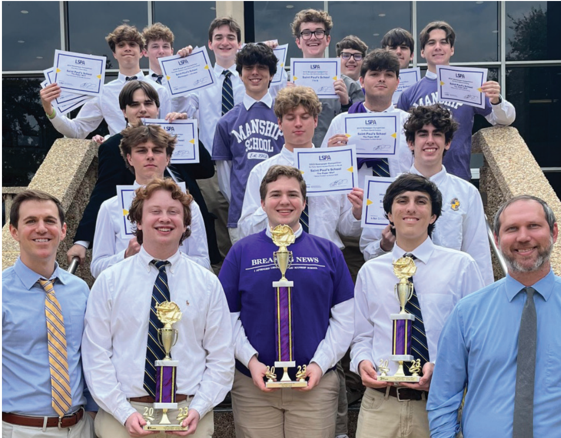
Journalism and broadcast teams from Saint Paul's School in Covington, Louisiana took home first place in Best Overall Media Sweepstakes at the 2023 LSPA Conference.