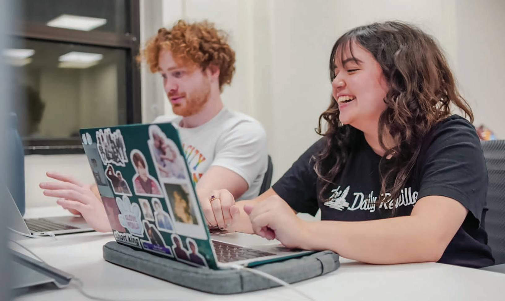
(Above) Reville reporters working in the newsroom.