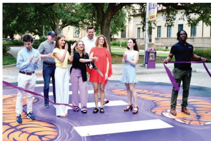
(Top) Political communication seniors create first and only “creative crosswalk” on campus. (Bottom) Ribbon cutting.