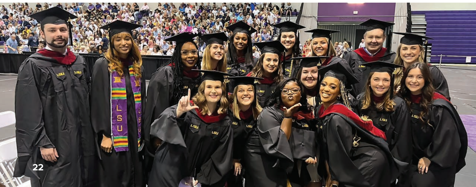
(Below) Spring 2023 MMC graduates.