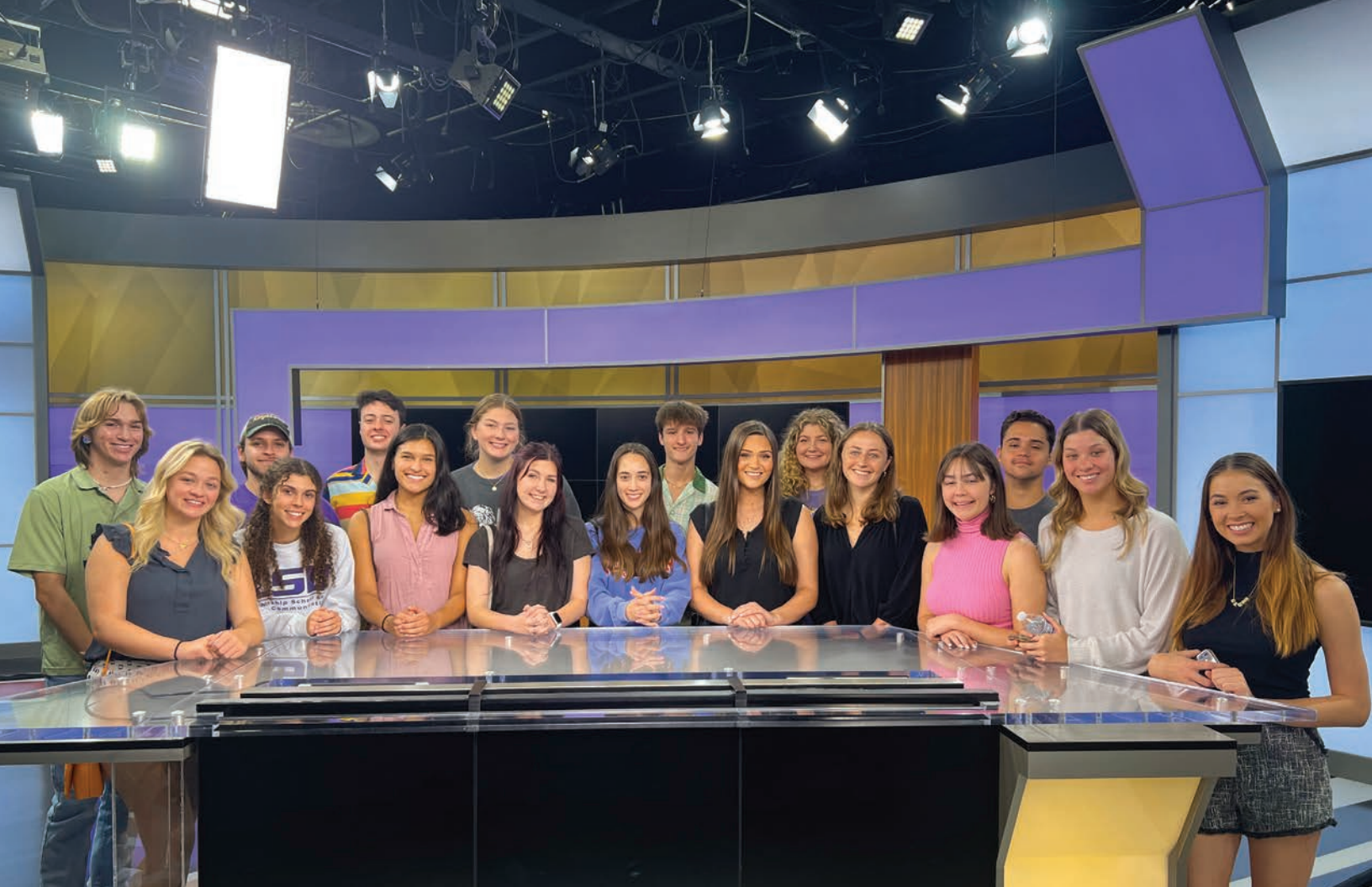
Tiger TV Students, Spring 2023.