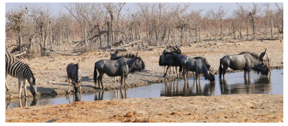
Blue wildebeest and plains zebras at a northern Namibian waterhole in August. At this time of year, there had been no rain for more than four months. Birds in the background appear to be Cape Starlings, a species that probably requires supplemental water to persist year-round in this landscape.