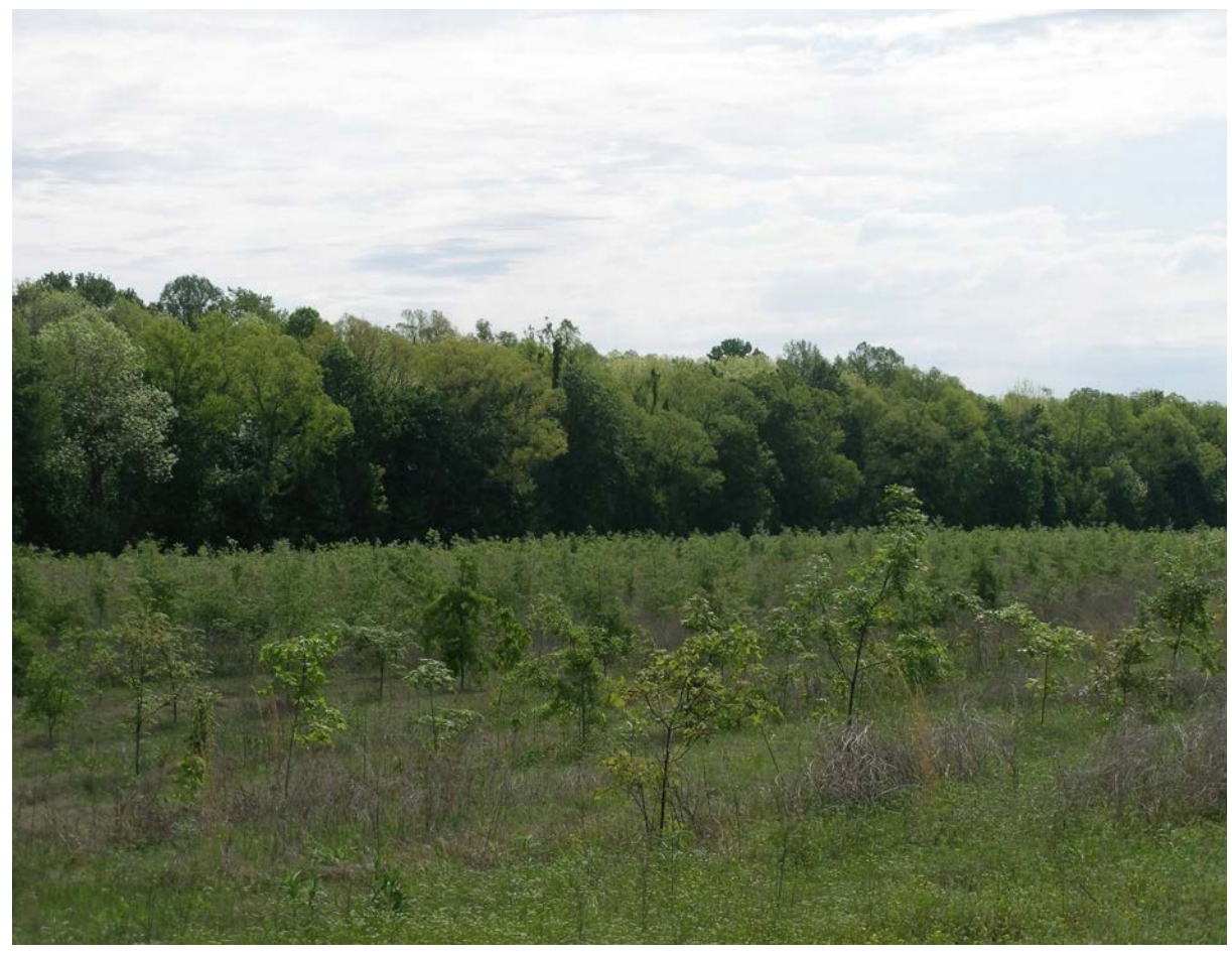
Restoration of forested wetlands will include planting seedlings in formerly cultivated fields.

The FWO is being funded by a publicprivate partnership — the first of its kind in