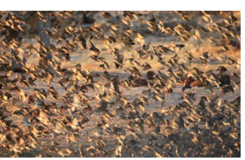
Part of a swarm of thousands of Red-billed Queleas visiting a waterhole just south of Etosha National Park, Namibia. These birds can be crop pests, and there is concern that they can transmit avian disease. Is their hyperabundance facilitated by supplemental water? The brown piles barely visible in the background reveal the recent presence of elephants, the major agents of vegetation structural change near waterholes.

Namibia has large populations of many characteristic African mammals, including rhinoceroses, elephants, lions, leopards and multiple antelopes. Research at NUST aims to understand how to effectively manage their populations to balance wild animal movements with livestock grazing, the main agricultural activity in most of the country. When