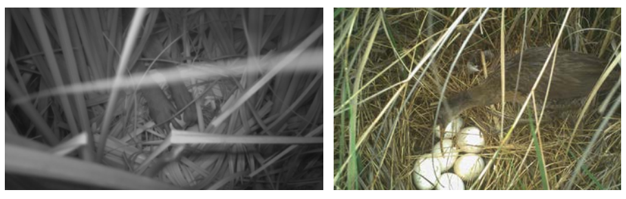
Left: Raccoon paws reaching for an egg from an artificial Mottled Duck nest in the sawgrass at Coastal Club private property. Right: Juvenile Clapper Rail depredating a nest in the cordgrass at Rockefeller Wildlife Refuge.

More than 6.3 million photos of wildlife (and vegetation) were collected during the two field seasons. Already, photos are shedding light on what is occurring in the Louisiana marshes and agricultural lands. Far more than just the usual raccoons, predators such as coyotes and opossums are making a meal of nests. American alligators have also been documented stalking nests, presumably waiting for a nesting hen to return, before settling for the eggs. American mink are a top nest predator in the marshes, frequently pulling eggs out of the nest for consumption. Cameras also captured the first recorded case of a King Rail depredating eggs. Purple Gallinule, Clapper Rail, corvids, and snakes also depredated nests. Alex expects more will be revealed as he and his team of student workers and interns continue to sort through the photos.