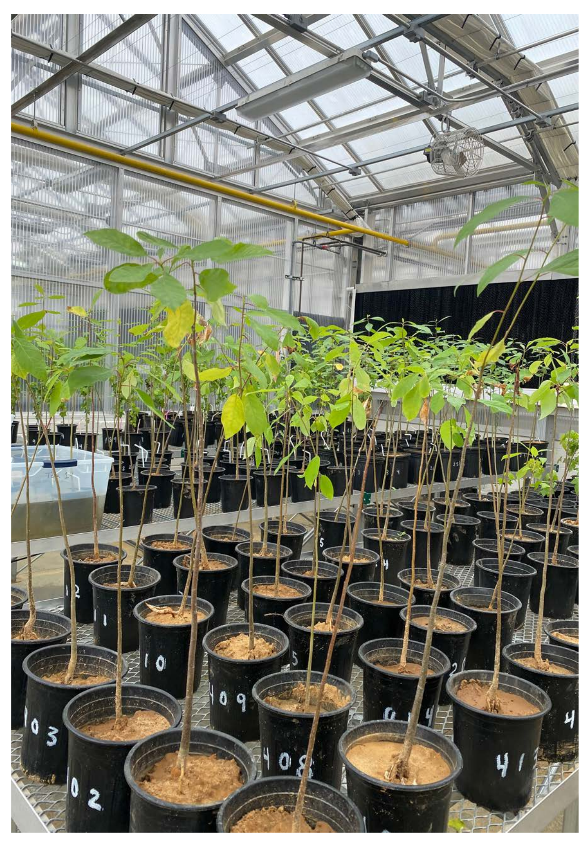
Sweetgum and water tupelo seedlings were grown in a greenhouse to test the effects of flooding on stomatal behavior.

A small proportion of captive tigers in the U.S. are maintained in Association of Zoos and Aquariums accredited zoos through species survival plans (SSP). In SSPs, subspecies are not interbred, and their breeding is carefully managed to avoid inbreeding, ensuring that the population has the maximum genetic diversity possible. This is done with pedigrees, but with an animal's entire genome, we can assess relatedness of individuals, helping to improve kinship estimates based on pedigrees. To that end, Bresnan has gathered and sequenced the genomes of 127 tiger samples from the three different tiger subspecies managed by the SSPs in the United States. Bresnan's research will be used to increase the knowledge we have regarding individuals in zoo populations, helping ensure that captive tiger populations are as robust as possible in case we need to tap them as genetic resources if tigers continue to decline or go extinct in the wild. By sequencing generic tigers, her research will also help shed light on the genetic consequences of breeding tigers for commercial purposes. Bresnan hopes that in unlocking the full genomes of captive tigers in the U.S., she will provide information that can be used as a foundation for future tiger conservation.