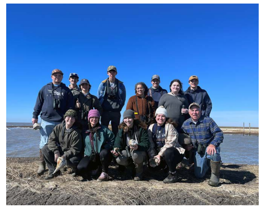
Students from RNR 3018, Ecology and Management of Louisiana Wildlife, view coastal erosion first-hand on the beach at Rockefeller State Wildlife Refuge. When it was deeded to the state of Louisiana in 1914, the refuge covered 86,000 acres of marsh and coastal habitat. Today, only 71,000 acres remain.