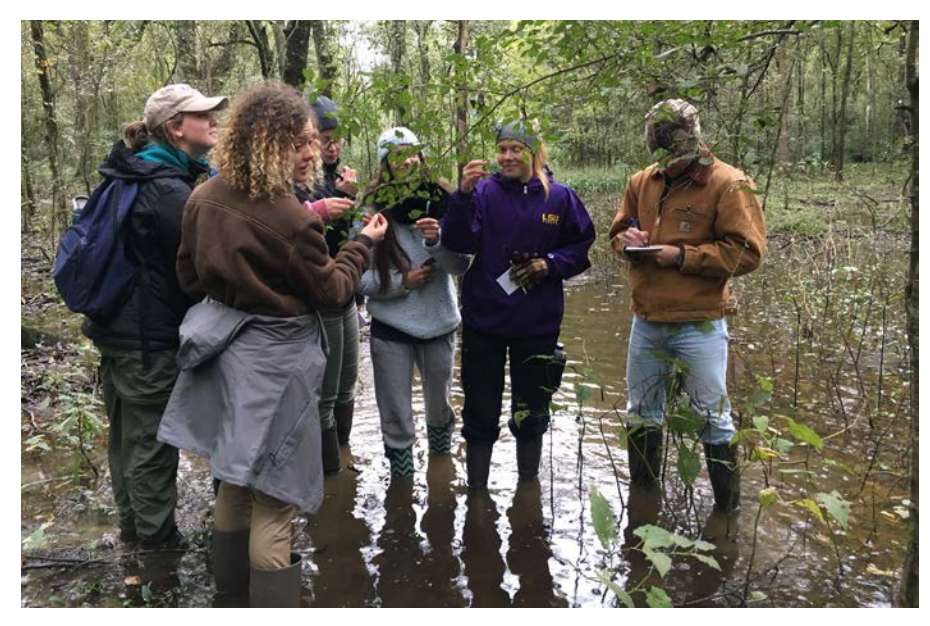
Students attempt to identify deciduous holly.