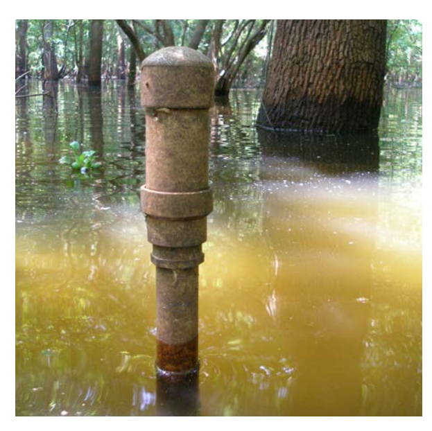
A water monitoring station emerges from receding floodwaters. Extensive instrumentation will make the Forested Wetlands Observatory an attractive site for a range of scientific objectives.

Louisiana — as a wetland mitigation bank, in which restoration treatments will generate wetland restoration credits to be sold to local land developers who require them to offset permitted wetland degradation elsewhere. This system of mitigation banking has been established by the U.S. Army Corps of Engineers, which uses it to provide flexibility for land development while simultaneously achieving the goal of no net loss of wetland functions as required under the Water Quality Act. Wetland mitigation allows landowners to retain ownership and some uses of their land, and also is extremely important in urbanizing south Louisiana where most development includes at least some wetlands. The publicprivate partnership structure of the FWO allows professional wetland mitigation bankers to perform the necessary regulatory and financial services, while the AgCenter and LSU focus on science, teaching and extension.