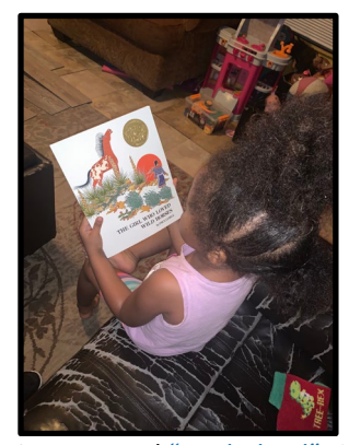
PHOTO: Students in AAAS/SOCL 2511: Race Relations created <u>"read-aloud" videos</u> for the <u>Zeiter Literacy Center</u>, read the book to a child in their life, and gifted it to that child or non-profit afterward. This is an easy example of how to do service safely from home, in line with CDC and state health guidelines.