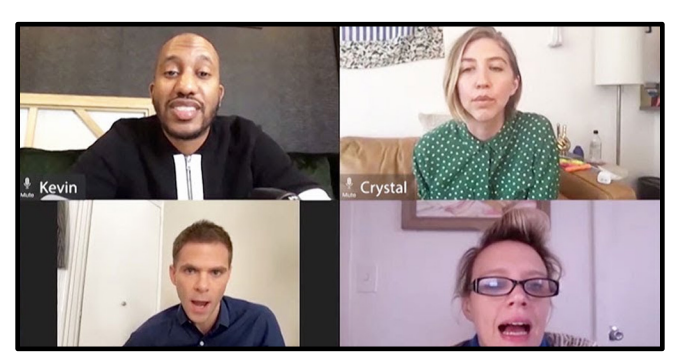
PHOTO: Saturday Night Live cast poking fun at the awkwardness of Zoom calls

To ensure you are prepared to engage, be sure you have: a) familiarity with and access to the tools the community partner needs you to use and b) access to technological equipment necessary to communicate and collaborate (eg. computer or phone that can record good video, high-speed internet connection). You can watch video tutorials online, practice the skill (eg. video making or Zoom conferencing) with friends and family, or read FAQ and instructional pages online prior to entering a service agreement with a community partner. If you do not have stable internet access at home, research resources your local public library or your educational institution may offer. During the early months of COVID-19 in 2020, for example, the East Baton Rouge Public Library system worked to provide high-speed internet to people in library parking lots when the buildings themselves had to close. Resources such as these could be available to you if your locality goes into another stay-at-home order and/or your internet access at home is not reliable enough to do the service you would like to.