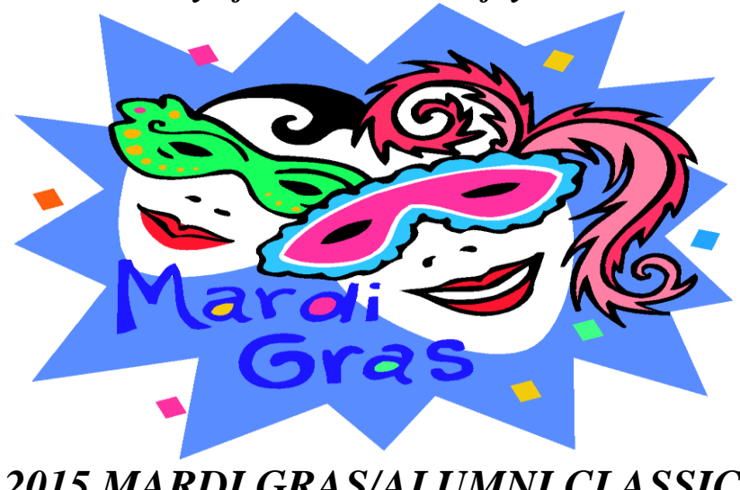
2015 MARDI GRAS/ALUMNI CLASSIC